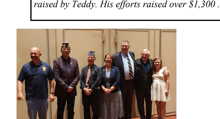
Various members representing the leadership of Department, Auxiliary, Detachment, Jr. Auxiliary and District 10 gave summations of the accomplishment of the year and weekend and a bright outlook for the coming year.