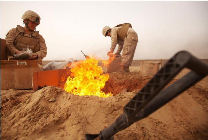
Marines dispose of trash in a burn pit in Afghanistan.

will take up a bipartisan bill that will dramatically broaden America's commitment to take care of sick veterans.