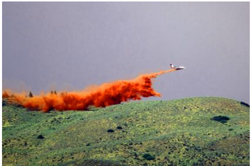
Agent Orange used in Vietnam-era

During a Sunday speech at a Memorial Day weekend event in Washington, Stewart said it was difficult not to be frustrated with Congress and the American people for taking so long to address the burn pits issue.