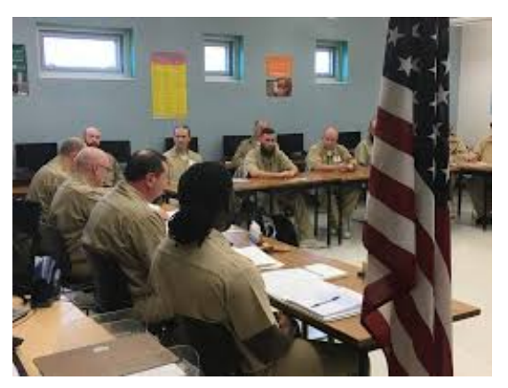
Incarcerated Veterans Attending a Transition Workshop in Hopes to Prevent Homelessness

Duhe talked about looking into the creation of a veterans court. This isn't meant to be an endorsement of either candidate. But veterans courts? There's an idea that deserves an endorsement. We've seen other types of courts aimed at a specific class of offenders, based on the idea that those offenders need some type of adjudication other than locking them up for a while and turning them back out. Juvenile courts and drug courts are examples. If you look at some statistics about veterans, you'll get the idea that they face specific types of problems that seem unlikely to be solved by a conventional approach.