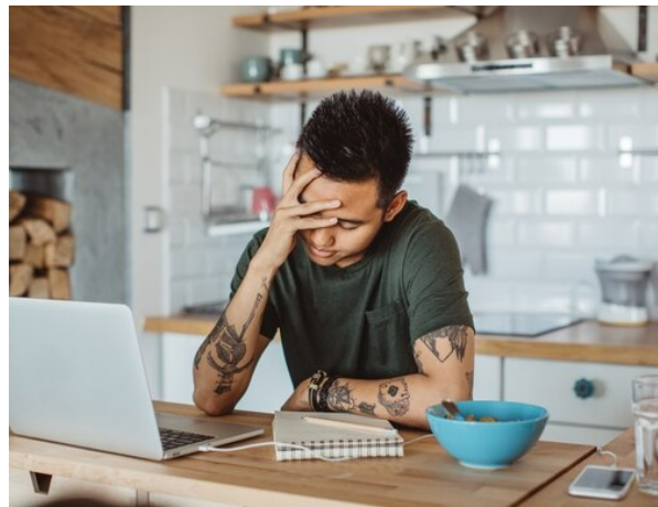
Unemployed Veterans: The struggles of trying to find employment still plagues nearly 700,000 veterans

Nationally, the unemployment rate dropped from 11.1 percent in June to 10.2 percent in July. That figure swelled to nearly 15 percent in April.