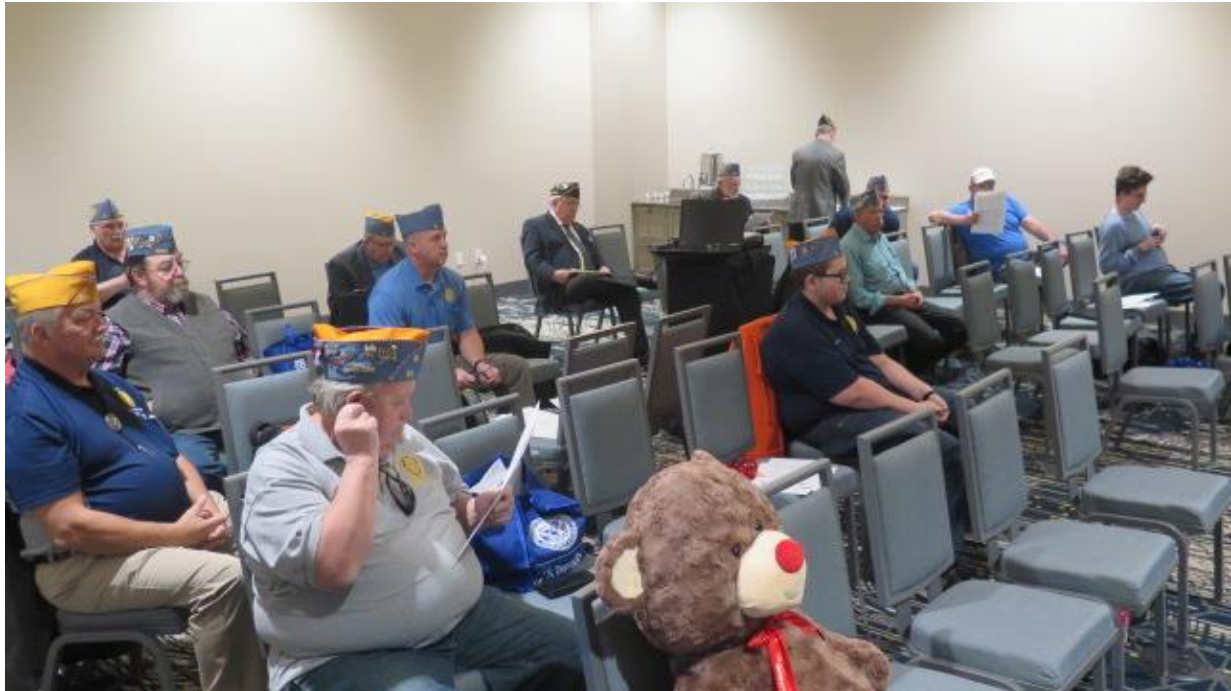
Overview of the DEC meeting.