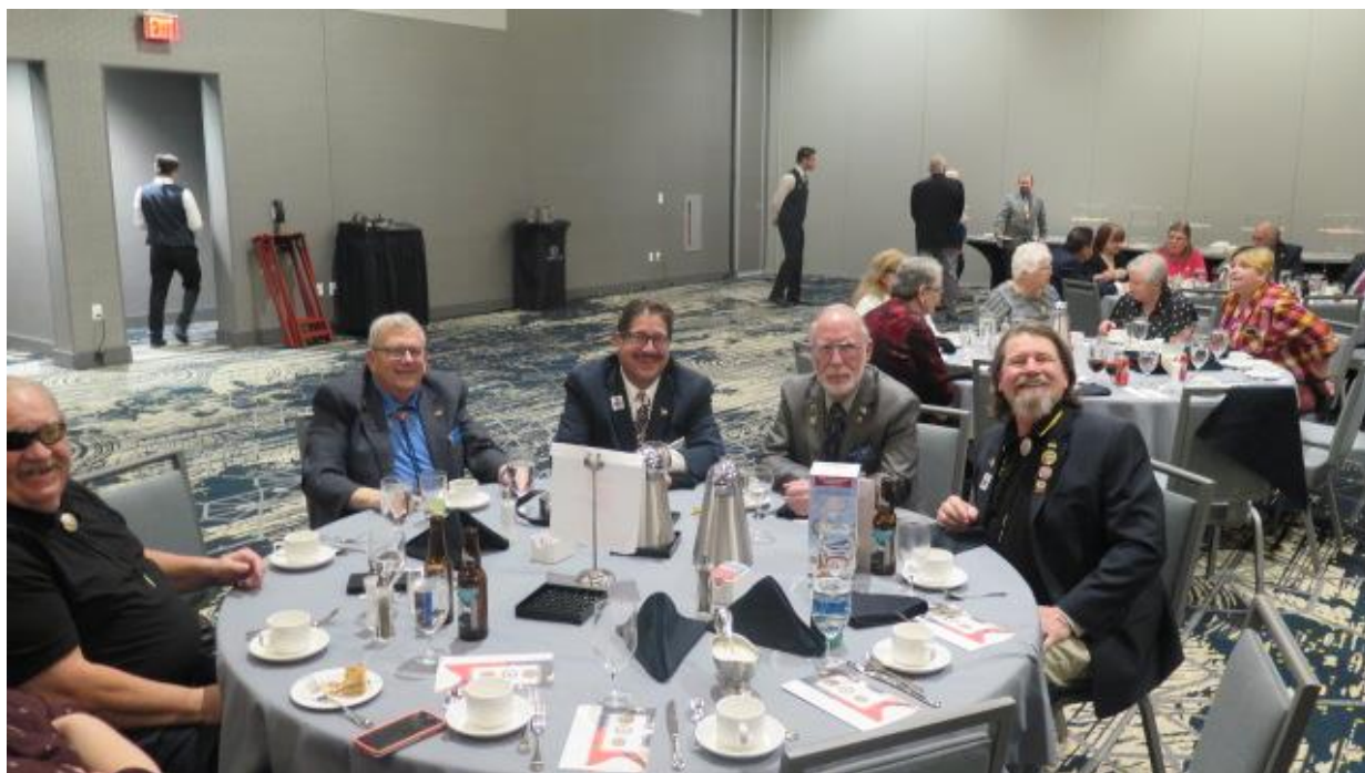
Saturday evening Media Awards Banquet. Finally! A chance to relax.