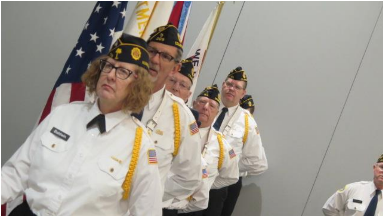
Post #209 Color Guard