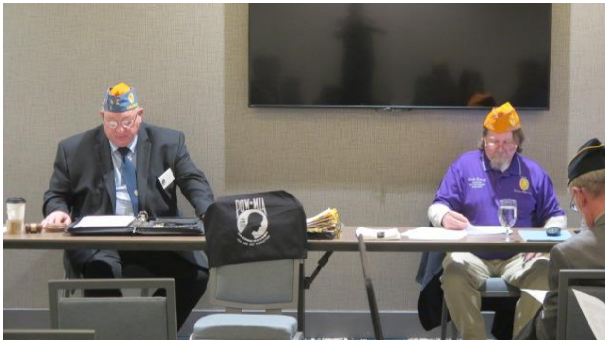
Head table. Commander & Adjutant.